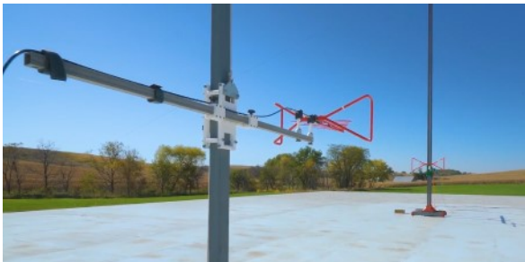
Figure 3. This CISPR antenna test was performed at our outdoor OATS on its CALTS-compliant ground plane.

As further testament to our expertise, standards bodies look to us for guidance during development of specifications. For instance, ANSI working groups have used our site during standards development. In addition, the COE team is on standards boards for ANSI and SAE.